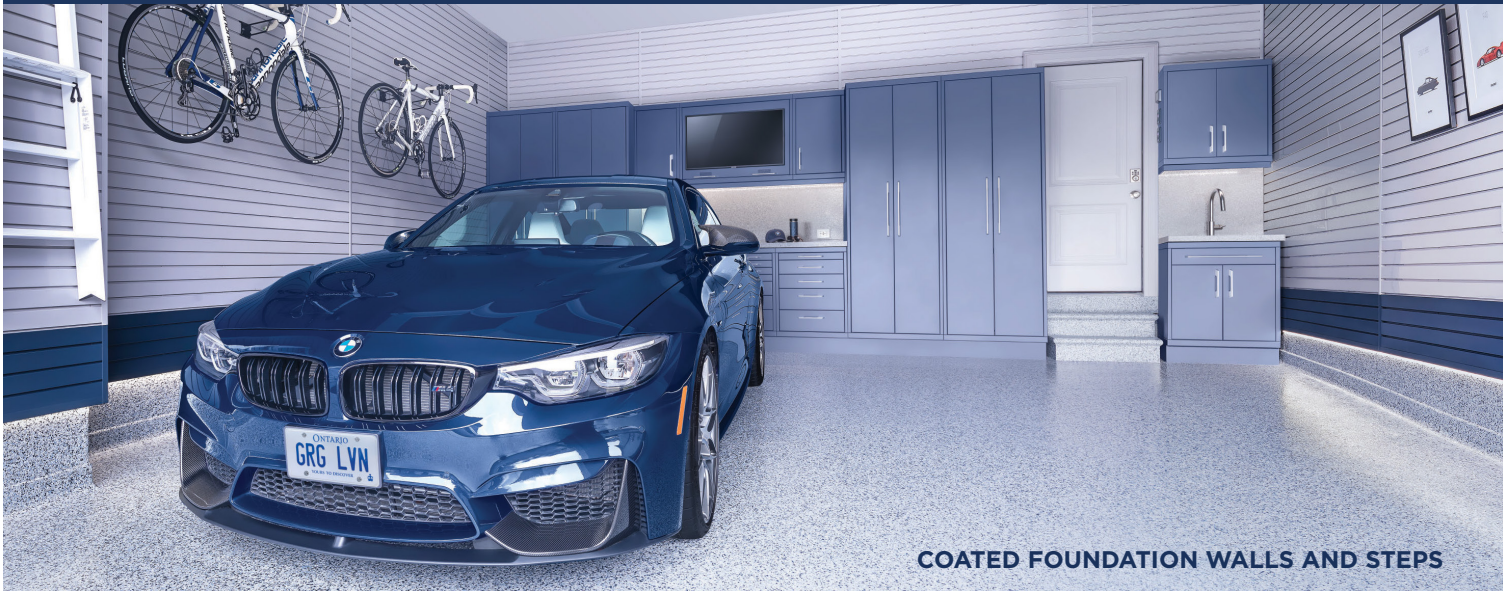
COATED FOUNDATION WALLS AND STEPS