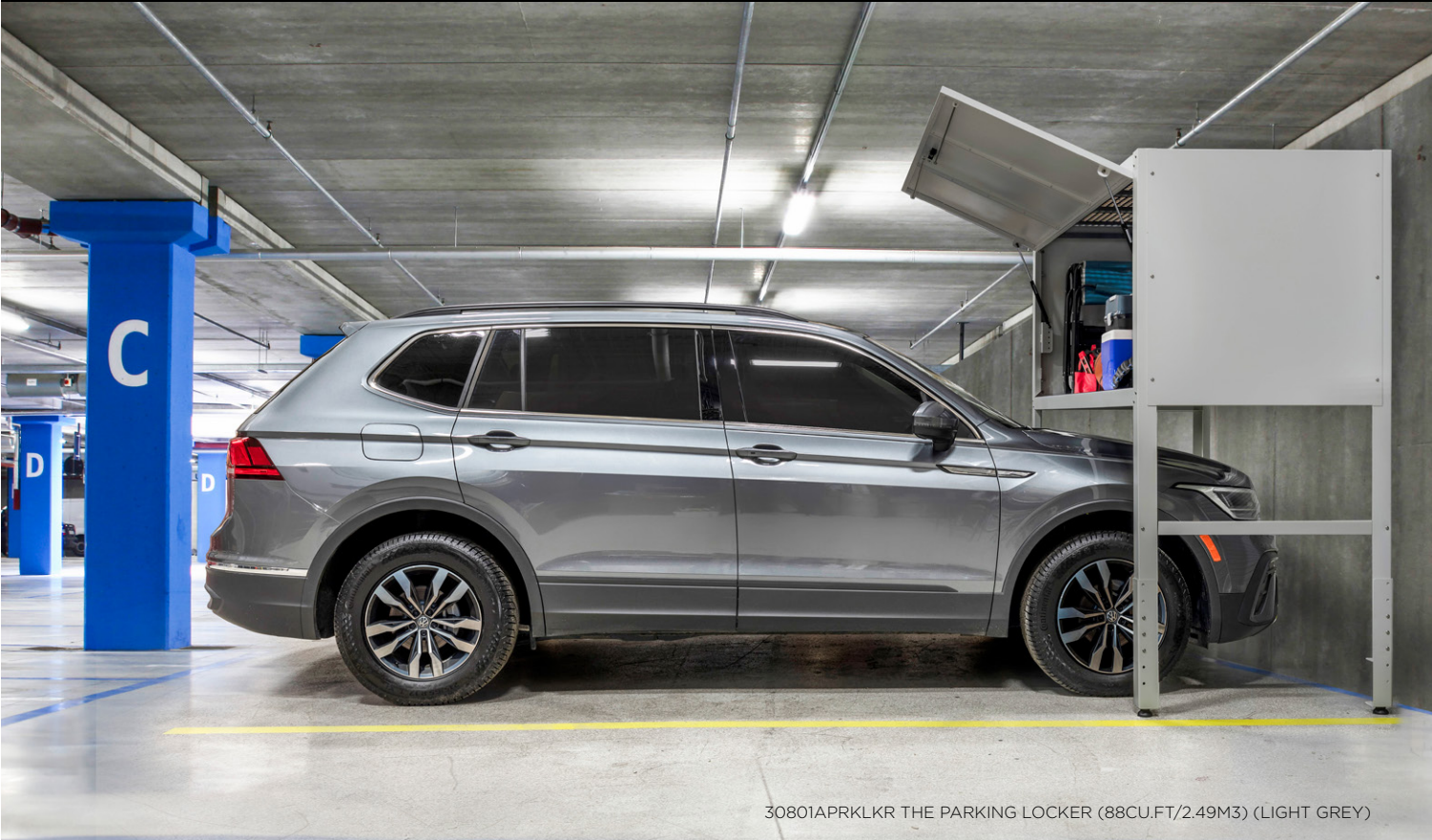
30801APRKLKR THE PARKING LOCKER (88CU.FT./2.49M3) (LIGHT GREY)