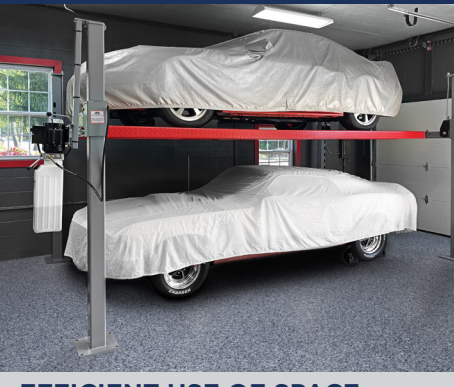
EFFICIENT USE OF SPACE