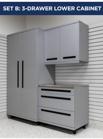
2-door locker, 3-drawer lower cabinet, 2-door upper cabinet, stainless steel countertop, valance